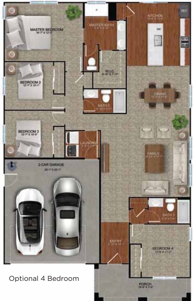
Optional 4 Bedroom

3 Bedroom - 2.5 Bathroom - Den-2 Car Garage Optional 4th Bedroom - 3 Bedroom 1,824 Square Feet