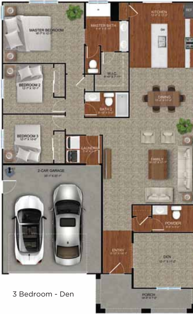
3 Bedroom - Den